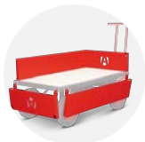
Turntable side kit TT1-SK

Disclaimer: all dimensions and weights are approximate